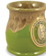
Moss w/Sand White Round Belly