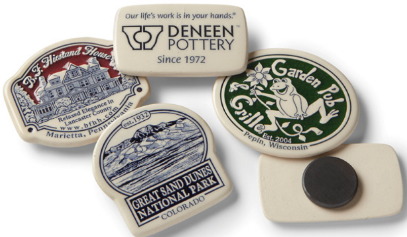
Pictured in Cranberry, Midnight, and Hunter Green

Magnets are almost identical to the mug emblems — just a bit thicker and they stick to your fridge! Packaged in bulk or also available in a compostable cellophane bag for easy displaying.