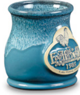
Peacock w/Black White Round Belly