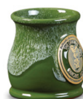
Forest w/White Round Belly