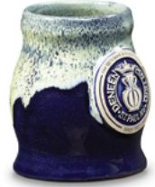
Midnight w/Kiwi White Patriot