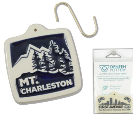
Pictured in Navy

Ornaments are also almost identical to the mug emblems — just a bit thicker. They come with a brass S-hook for hanging and pre-packaged in a compostable cellophane bag for easy displaying.