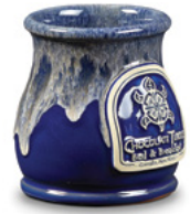
Navy w/Sand White Round Belly