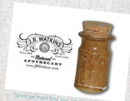
Spice jar from first big J.R. Watkins order