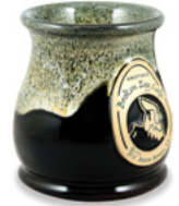
Black w/Dijon White Round Belly