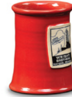
Red w/Black Fill • Ramsey