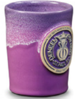
Lilac w/Plum White Small Abby