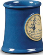
Federal Blue Straight