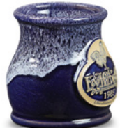
Midnight w/Plum White • Round Belly