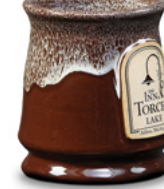
Chocolate w/White Footed