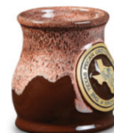
Chocolate w/Coral White Round Belly