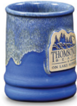
Sky Blue w/Dijon White • Ramsey