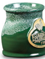
Hunter w/White Round Belly