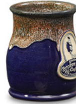
Midnight w/Cinn. White • Tall Belly