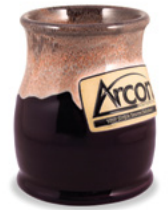
Plum w/Sunset White Tall Belly