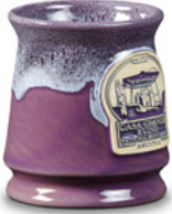
Purple w/Plum White Footed