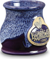
Plum w/Navy White Round Belly