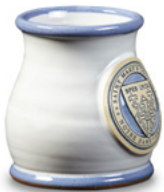
Gloss w/Blue Trim Round Belly

ALL GLAZES ARE SUBJECT TO VARIATIONS IN COLOR, HUE, AND APPEARANCE.