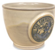
Butter w/White French Latte