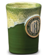
Forest w/Sunshine White Abby