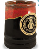
Black w/Sunshine Red Norg Tankard