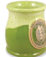
Moss w/Kiwi White Round Belly