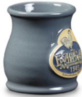
Grey Round Belly