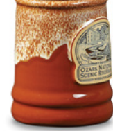
Cinnamon w/Dijon White Ramsey