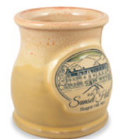
Lt. Dijon w/Coral White Round Belly