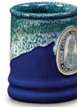
Navy w/Hunter White Ramsey