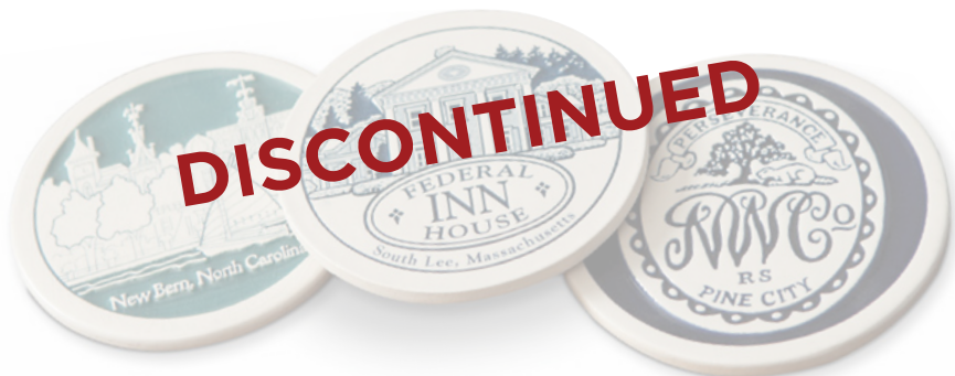
Pictured in Lt. Teal, Navy, and Midnight

College bookstores sell them as paper weights and our best innkeepers love their classy detail and use them in the sitting room or on bedside tables.