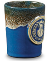
Federal Blue w/Cinn. White • Small Abby