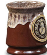
Chocolate w/Sand White Footed