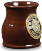
Chocolate Round Belly