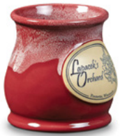
Cranberry w/White Round Belly

ALL GLAZES ARE SUBJECT TO VARIATIONS IN COLOR, HUE, AND APPEARANCE.