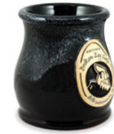
Black w/White Round Belly