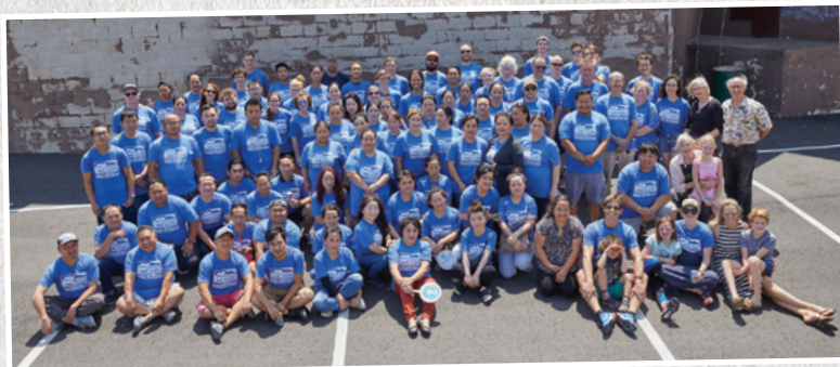
Deneen Pottery staff at the 2019 Summer Party