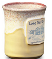
Lt. Dijon w/Burg. White Flare