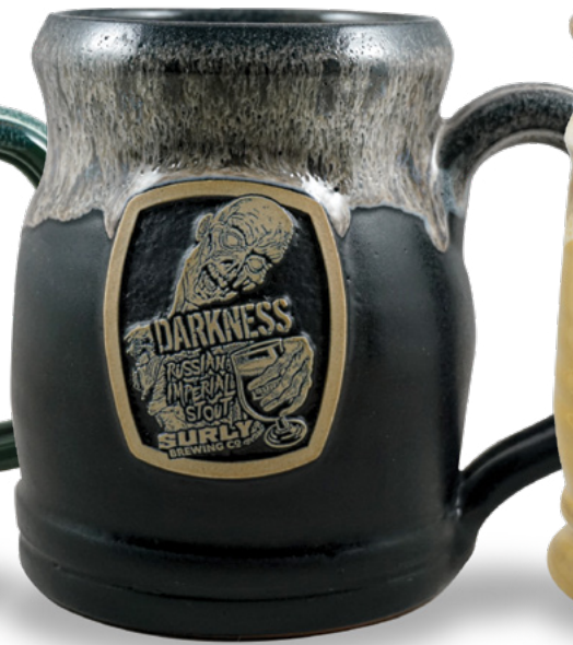
Endicott Tankard 22 oz. • Matte Black w/Sand