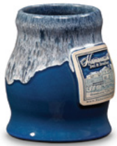
Heritage Blue w/Sand White • Patriot