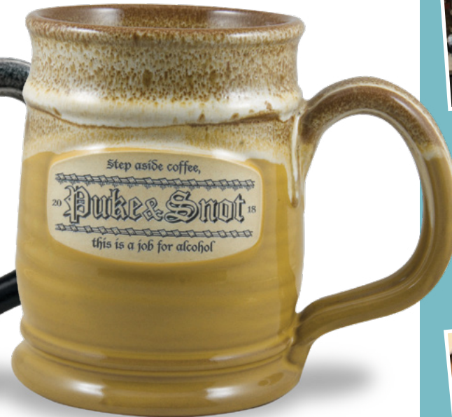
Nokomis Tankard 23 oz. • Dijon w/Cinnamon White