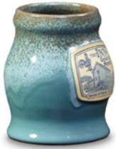
Lt. Teal w/Cinn. White Patriot

ALL GLAZES ARE SUBJECT TO VARIATIONS IN COLOR, HUE, AND APPEARANCE.