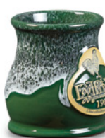
Hunter w/Black White Round Belly