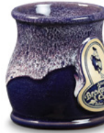
Midnight w/Rose White • Round Belly