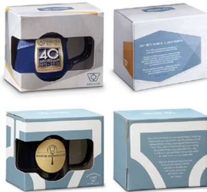
Available in lightweight (top) or heavyweight (bottom)