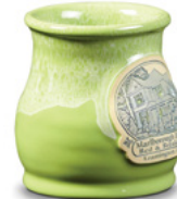
Kiwi w/White Round Belly