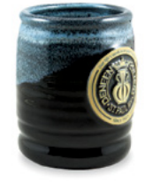
Black w/Powder Blue Lumberjack