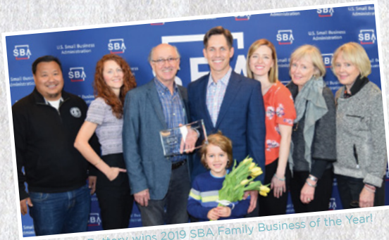
Deneen Pottery wins 2019 SBA Family Business of the Year!