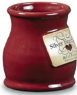
Burgundy Round Belly