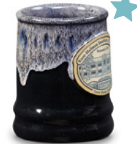
Black w/Sand White Ramsey