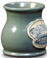
Sage Round Belly