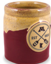
Burgundy w/Sunshine Camper