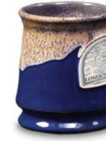
Navy w/Sunset White Footed