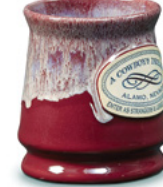
Burgundy w/Sand White Footed