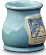
Seafoam w/White Round Belly