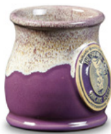
Purple w/Dijon White Round Belly