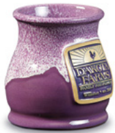
Purple w/Lilac White Round Belly