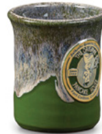
Forest w/Sand White Flare