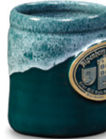
Teal w/White Camper