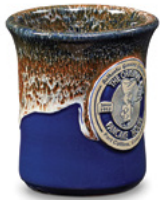
Navy w/Cinn. White Flare