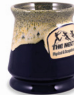
Midnight w/Sunshine White • Footed