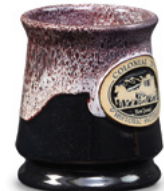
Black w/Burgundy White Footed