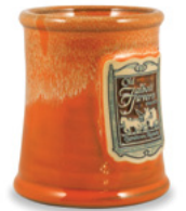
Sunset Orange w/Dijon White Straight