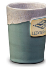
Sage w/Sand White Abby