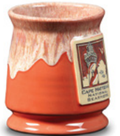
Coral w/Sand White Footed