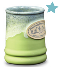
Kiwi w/Blue White Ramsey