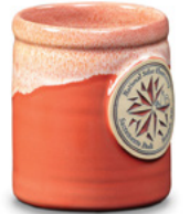
Coral w/Dijon White Camper