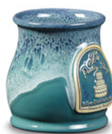
Lt. Teal w/Blue White Round Belly