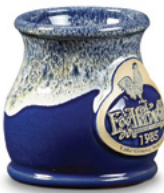
Navy w/Dijon White Round Belly