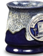
Midnight w/Dijon White • Footed