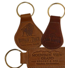
Available shapes: Rectangle, Small, & Large

Please note that leather is a natural material. Every lot will have a variance and there can be noticeable differences in color and texture within an order.