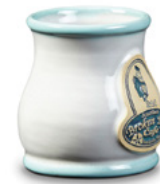
Gloss w/Green Trim w/Lt. Teal Fill • Round Belly