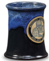
Black w/Navy Junior Executive