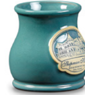
Light Teal Round Belly