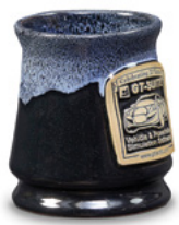
Black w/Navy White Footed