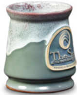
Sage w/Burgundy White Footed