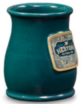
Teal Tall Belly