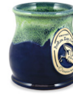
Navy w/Kiwi White Round Belly