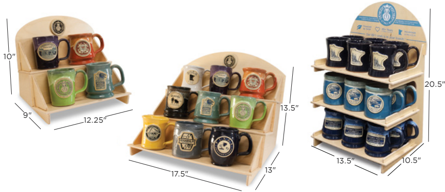
Available in three sizes (4, 9, or 18 mugs).

Displaying your mugs will help them sell, which means we get to make more for you! These birch shelves ship flat and don't take up much space at all.