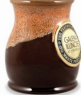
Chocolate w/Sunset White Tall Belly