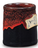
Black w/Red Rancher