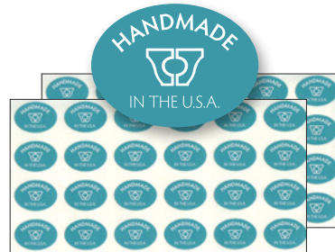
Available in sheets of 24 Sticker Size: .75" x .5"

Although each mug is stamped with this on the bottom, placing another indicator on the front helps answer the question right away.