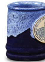
Midnight w/Sky Blue White • Ramsey