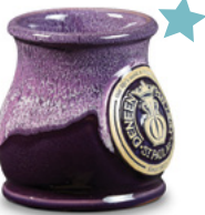
Plum w/Lilac White Round Belly