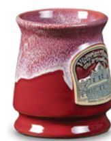
Cranberry w/Lilac White Footed