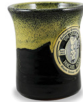
Black w/Sunshine Flare