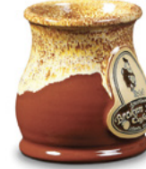
Cinnamon w/Sunshine White Round Belly