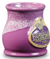
Lilac w/White Round Belly