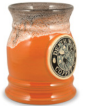
Sunset Orange w/Black White & Black Fill Round Tankard