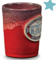
Red w/Black White Small Abby