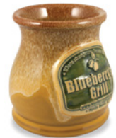
Dijon w/Cinnamon White Round Belly