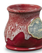
Burgundy w/White Round Belly