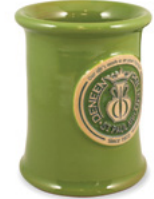
Moss Junior Executive