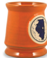
Sunset Orange w/Navy Fill • Footed

Depending on your chosen glaze color and the amount of recessed area in the medallion design, we may recommend additional backfill. Please see some of our available fill options below.