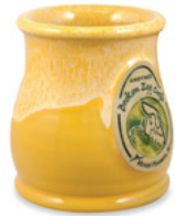
Sunshine w/White Round Belly