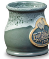
Sage w/Hunter White Round Belly