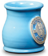
Powder Blue Round Belly