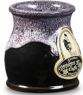
Black w/Lilac White Round Belly