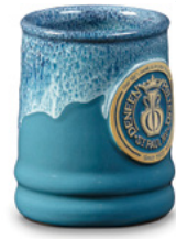
Peacock w/Blue White Ramsey