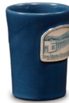
Heritage Blue Abby