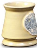
Light Dijon Footed