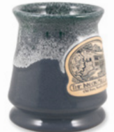
Grey w/Hunter White Footed