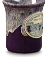
Plum w/Sand White Flare