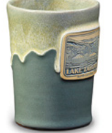
Sage w/Dijon White Abby