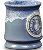
Grey w/Blue White Footed