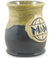
Grey w/Sunshine White Tall Belly