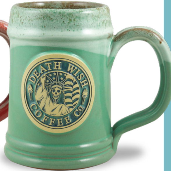
Straight Tankard 18 oz. • Mint w/Cinnamon White