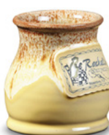
Lt. Dijon w/Cinn. White Round Belly