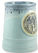
Aqua w/ Black White Norg Tankard