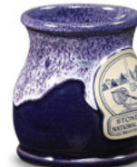
Midnight w/Lilac White • Round Belly