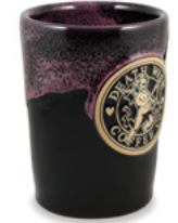
Black w/Pink Abby