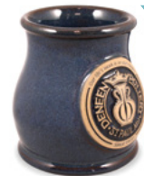
Denim Round Belly