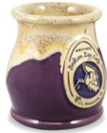
Purple w/Sunshine White • Round Belly