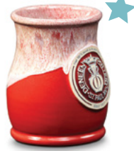
Red w/Sand White Tall Belly