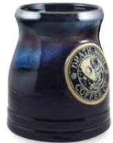
Galaxy Endicott Tankard