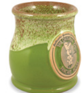
Moss w/Cinn. White Round Belly