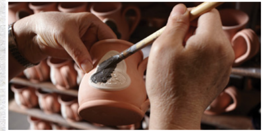
Blue slip being painted onto medallion