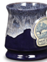
Midnight w/Sand White • Footed