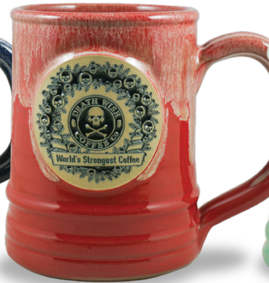
Norg Tankard 18 oz. • Red w/Sand White w/Black Fill