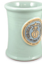
Aqua Junior Executive