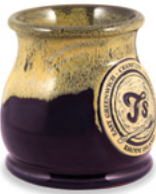
Plum w/Sunshine White • Round Belly

All glazes are subject to variation in color, hue, and appearance. Each of our pieces vary slightly in accordance with their handmade origins and are not considered seconds because of these variations.