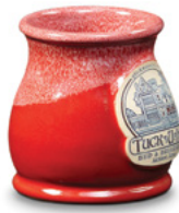
Red w/White Round Belly