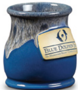
Federal Blue w/Sand White • Round Belly