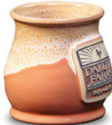
Peach w/Dijon White Round Belly