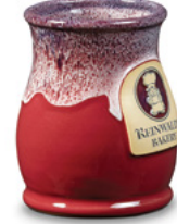
Cranberry w/Blue White Tall Belly