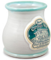
Gloss w/Green Trim Round Belly