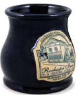
Midnight Round Belly