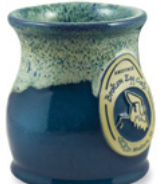
Federal Blue w/ Sunshine White • Round Belly