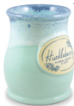
Aqua w/ Blue White Tall Belly