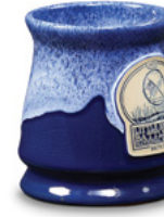
Navy w/Sky Blue White • Footed