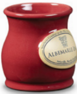
Cranberry Round Belly