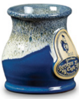
Federal Blue w/Dijon White • Round Belly