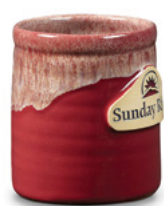
Cranberry w/Sand White Camper