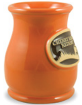
Sunset Orange w/Chocolate Fill • Tall Belly