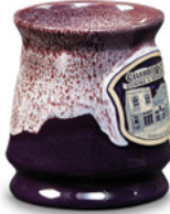
Plum w/Burgundy White • Footed