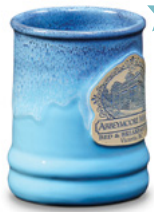
Powder Blue w/Blue White • Ramsey