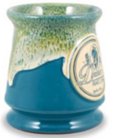
Peacock w/Dijon White Footed