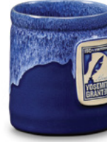
Navy w/White Camper