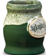
Hunter w/Dijon White Patriot