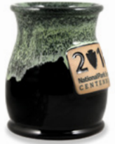
Black w/Kiwi White Tall Belly