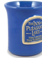
Sky Blue Flare