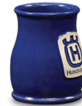
Navy Tall Belly