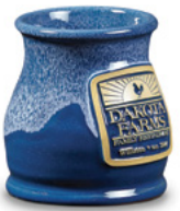
Federal Blue w/White Round Belly