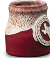
Burgundy w/Dijon White