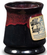
Black w/Burgundy Footed