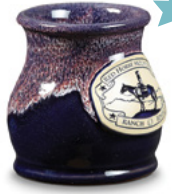
Midnight w/Burg. White • Round Belly