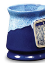
Navy w/Powder Blue White • Footed