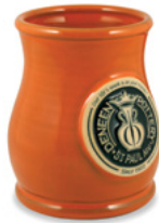
Sunset Orange w/ Black Fill • Tall Belly