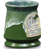
Forest w/Blue White Footed