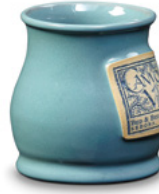
Seafoam Round Belly