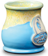
Powder Blue w/Sunshine White • Round Belly