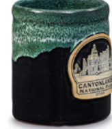
Black w/Hunter White Camper