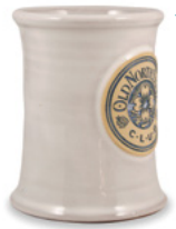
Gloss Junior Executive

ALL GLAZES ARE SUBJECT TO VARIATIONS IN COLOR, HUE, AND APPEARANCE.