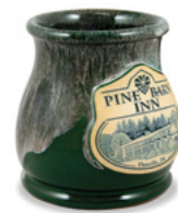
Hunter w/Sand White Round Belly