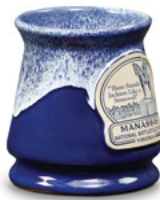
Navy w/Grey White Footed