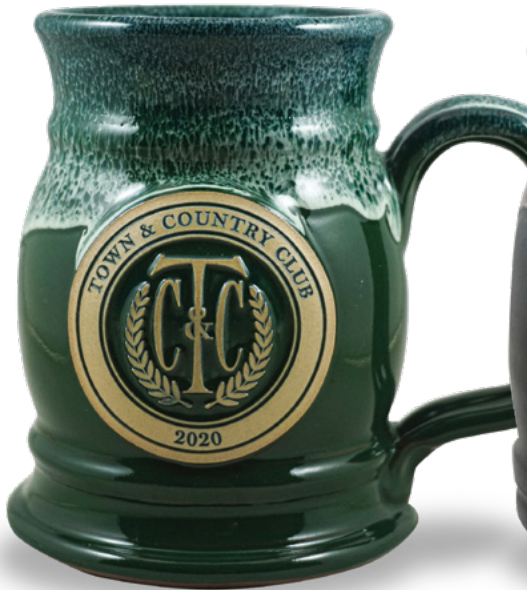
Round Tankard 18 oz. • Hunter w/Blue White