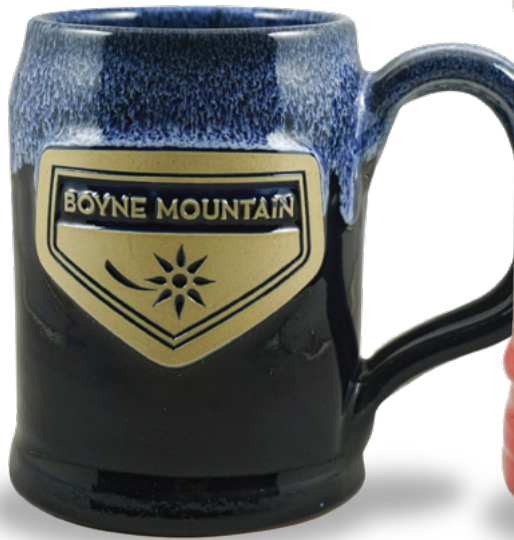
German Tankard 16 oz. • Black w/Blue White

CAPACITIES SHOWN ARE NOT EXACT - ALL HANDTHROWN FORMS CAN VARY +/- AN OUNCE.