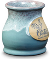
Seafoam w/Rose White Round Belly