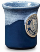
Heritage Blue w/White Flare