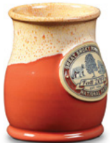
Coral w/Sunshine White Tall Belly