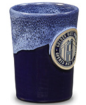
Midnight w/White Abby