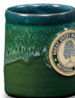
Hunter w/Blue White Camper