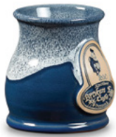
Heritage Blue w/Grey White • Round Belly

ALL GLAZES ARE SUBJECT TO VARIATIONS IN COLOR, HUE, AND APPEARANCE.