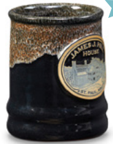
Black w/Cinnamon White Ramsey