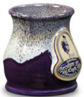
Plum w/Dijon White Round Belly