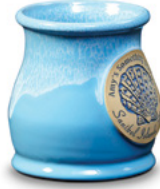
Powder Blue w/White Round Belly