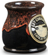
Black w/Coral Round Belly