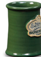
Hunter Junior Executive