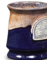
Midnight w/Sunset White • Footed