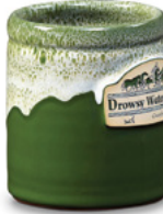
Forest w/Dijon White Camper