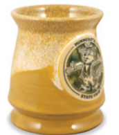
Dijon w/White Footed