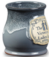
Grey w/Black White Round Belly