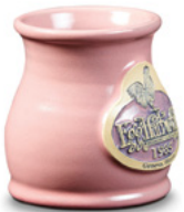
Pink Round Belly