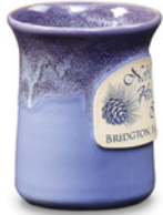
Wisteria w/Plum Flare