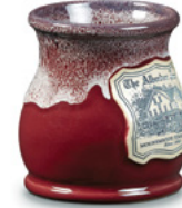
Burgundy w/Blue White Round Belly