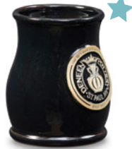
Black Tall Belly