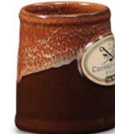
Chocolate w/Cinn. White Rancher