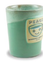
Mint w/Cinnamon White Small Abby